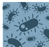
INFECTIOUS DISEASE SERIES

About 1.2 billion people worldwide are estimated to suffer from a fungal disease (1, 2). Most are infections of the skin or mucosa, which respond readily to therapy, but a substantial minority is invasive or chronic and difficult to diagnose and treat. An estimated 1.5 to 2 million people die of a fungal infection each year, surpassing those killed by either malaria or tuberculosis (3). Most of this mortality is caused by species belonging to four genera of fungi: Aspergillus , Candida , Cryptococcus , and Pneumocystis . Although great strides were made in the 1990s, drug development has largely stalled since then. Opportunities exist for accelerating development, particularly in fungal asthma, and to treat chronic and invasive aspergillosis.