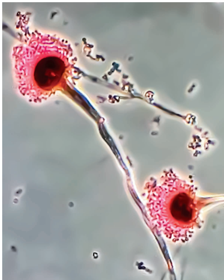
Photomicrograph of Aspergillus fumigatus . This fungus causes life-threatening invasive and chronic aspergillosis as well as driving severe asthma. Although drug treatments exist, mortality remains high.